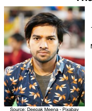
Population: 20,000 World Popl: 24,341,800 Total Countries: 31 People Cluster: Thai Main Language: Thai Main Religion: Buddhism Status: Unreached Evangelicals: 0.20%

Chr Adherents: 0.70% Scripture: Complete Bible