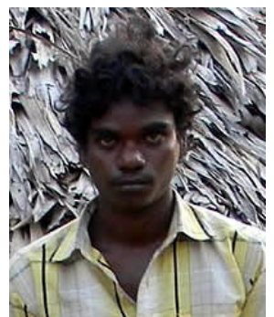
Population: 800,000 World Popl: 800,000

Total Countries: 1 People Cluster: South Asia Tribal - other