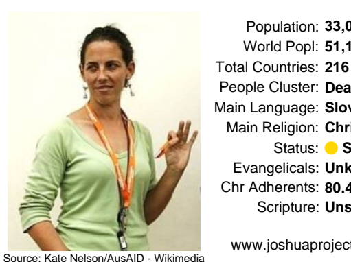
Main Language: Slovenian Sign Language Main Religion: Christianity